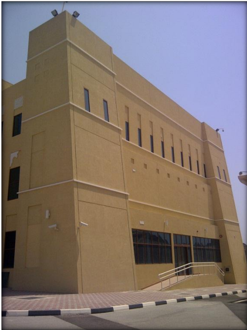
Commercial / Offices